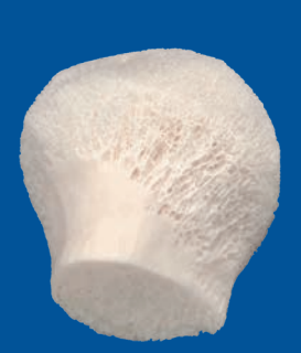
Whole femoral head